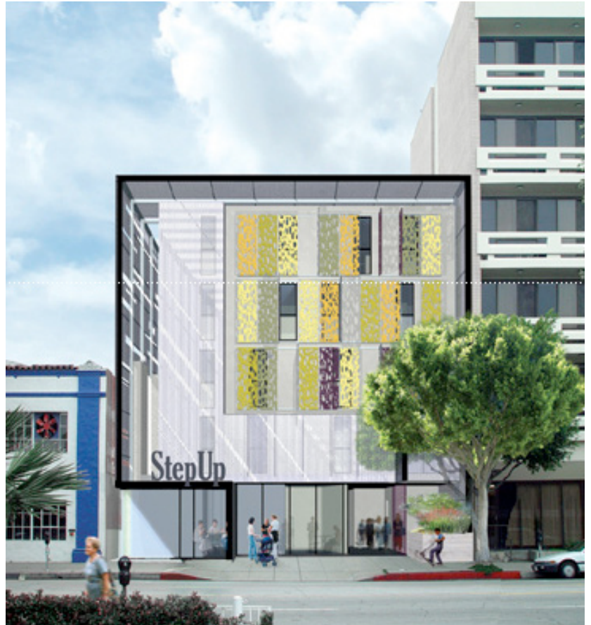
step up on fifth east elevation (architect Pugh + Scarpa)